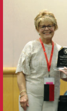
WOMAN OF THE YEAR ➤