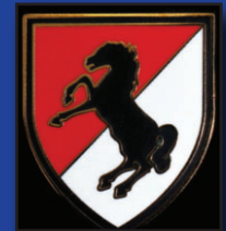
#17 Blackhorse Pin $5.00