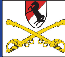
#35 See through Window Decal Sabers and Patch, 12" x 13" $15.00