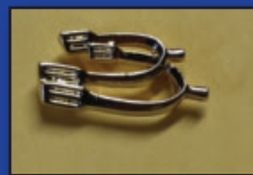
#31 Lapel or Hat Pin Size Spurs $7.00