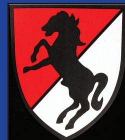
#26 Large Magnetic Patch (8" x 7 3/4") $7.00