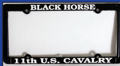
#14 License Plate Frame, Black w/white letters $13.00