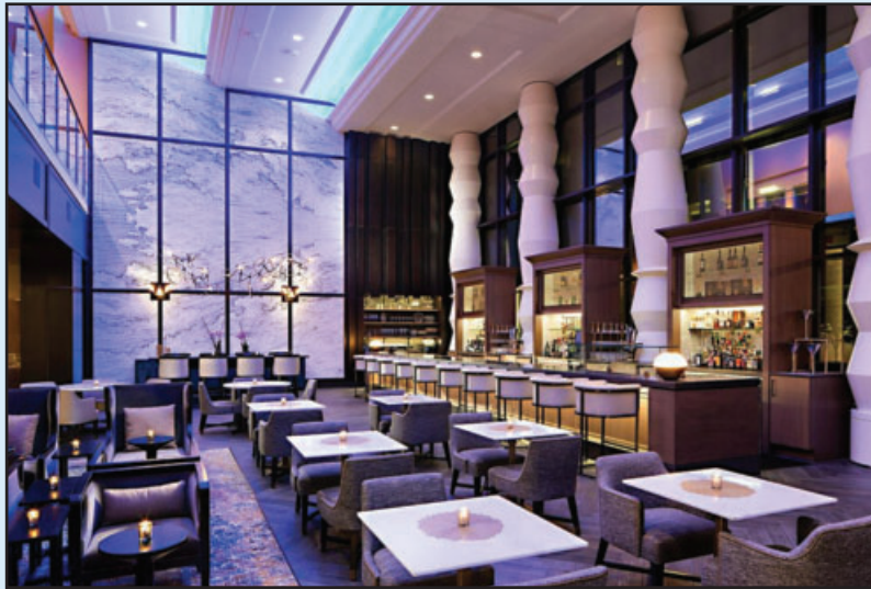
Amway Grand Plaza Hotel, 187 Monroe NW Grand Rapids, MI 49503

11ACVVC 13194 Rettew Dr. Manassas, VA 20112-7800 CHANGE SERVICE REQUESTED