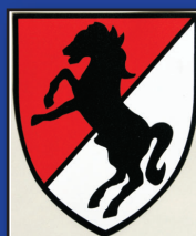
#21 Small Magnetic Patch (5" x 4 3/4") $5.00