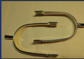
#27 Golden Boot Spurs $30.00