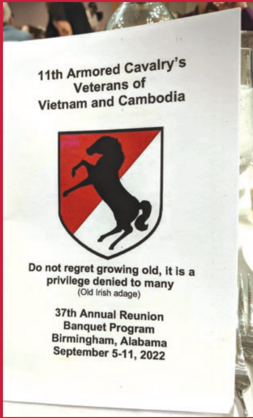
THE PRIVILEGE ▲