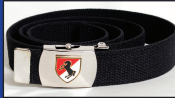
#10 Web Belt with buckle $25.00