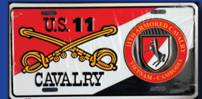
#13 License Plate, Blackhorse $9.00