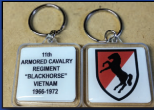
#2 Key Ring $6.00