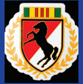
#4 Window Sticker $3.00