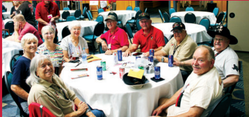
IN THE BUNKER