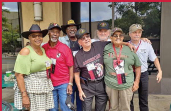
TROOPERS & WIVES ◀