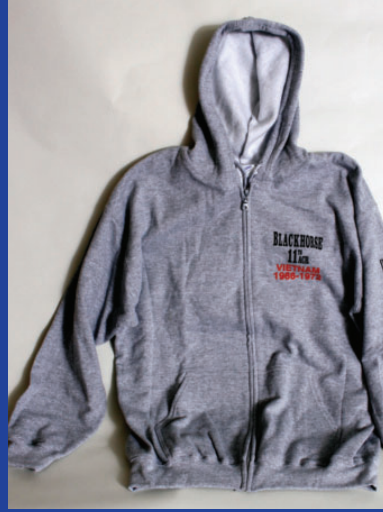
#5 Hoodie Sweat Shirt $30.00