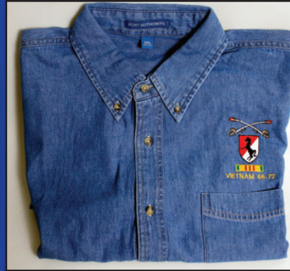
Dark Denim Shirt, w/BH & VN Ribbon $35.00