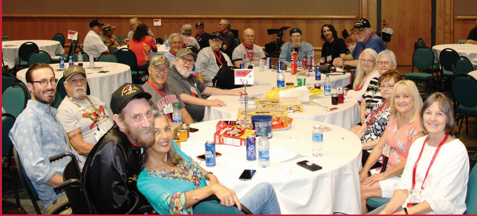
3RD HOW BAT ▲