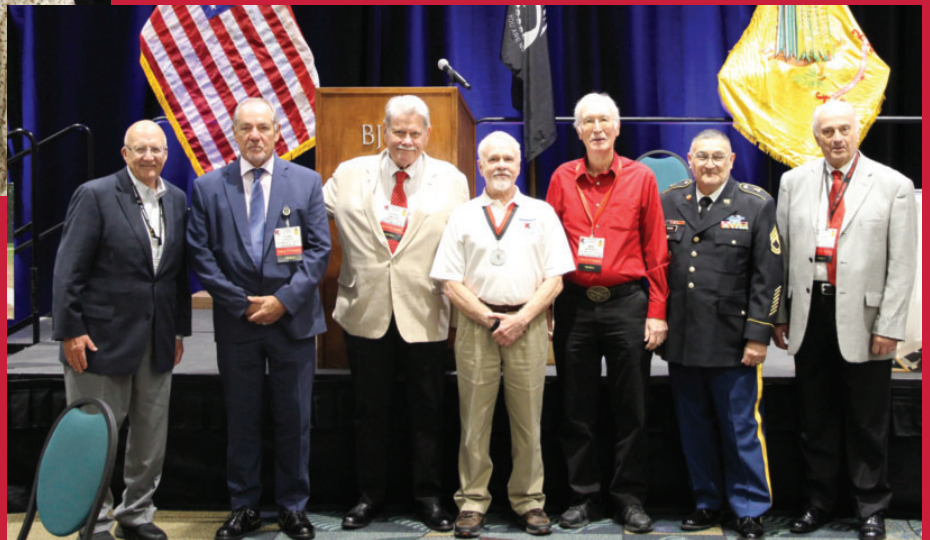
11th ACVVC OFFICERS