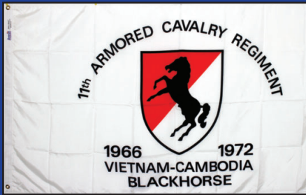
#11 Flag, Indoor/Outdoor $60.00