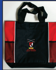
#16 Tote Bag, Embroidered $22.00