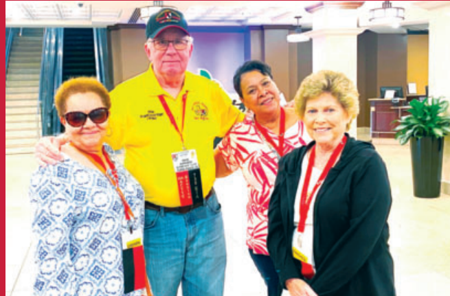
WELCOMING FRIENDS ▲