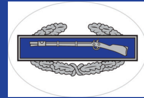
#9 CIB car magnet, 3"x4" $6.00