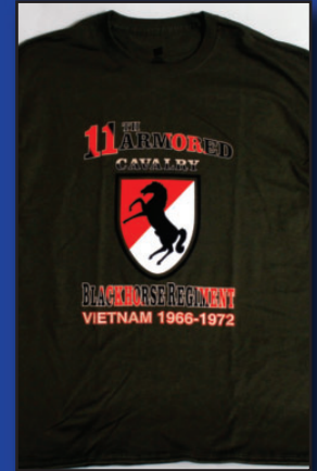
#39 a/b T-Shirt, Light Gray & Green $20.00