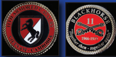
#25 Blackhorse Coin $15.00