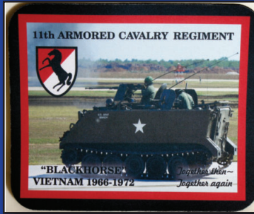
#8 Mouse Pad $12.00