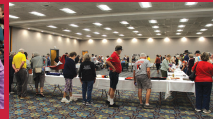
◀ SILENT AUCTION ▶