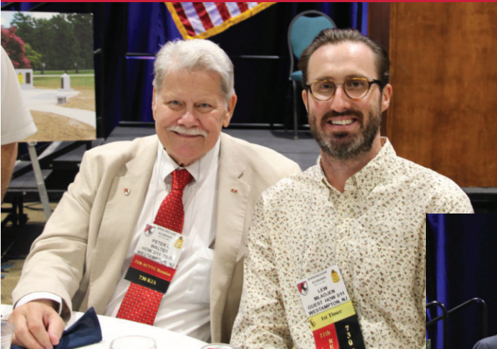
UNK & LEW