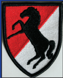
#7 Blackhorse Patch Colored $5.00